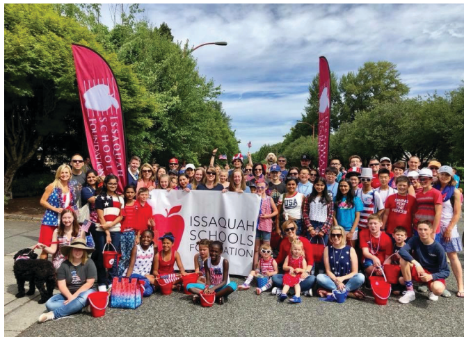
Superintendent Issaquah School District